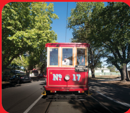
Ride aboard Bendigo's vintage tram

Bendigo is a vibrant hub in regional Victoria. Originally the epicentre of the 1850s goldrush, it is rich in Australian history and features grand, Victorian-era architecture. Bendigo also has a strong multicultural history, with one in five members of its early population emigrating from China. Now a large and modern city, it remains surrounded by native bushland. This gives it a bright yet relaxed energy and ensures a rich and focused learning experience.