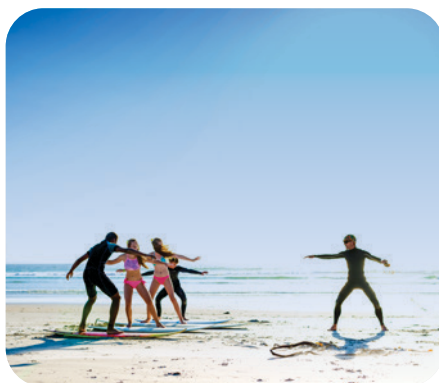
Learn to surf at one of Victoria's many beaches

Victoria's size makes it easy to explore. Rent a car, catch a train or book a tour to see the Great Ocean Road, Phillip Island, the Otways, Wilsons Promontory and wineries in the Yarra Valley. Go hiking in the You Yangs or the Grampians. Visit the historic cities of Healesville and Castlemaine, or take in the alpine wilderness of the Snowy Mountains area.