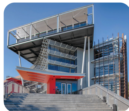
La Trobe University, Bendigo Campus