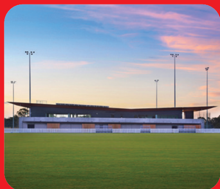
La Trobe University Sports Park

latrobe.edu.au/sport/facilities/bundoora-sports-facilities/la-trobe-sports-park