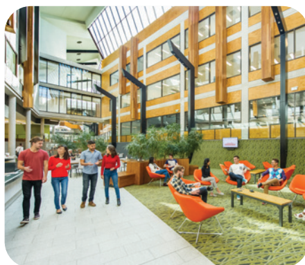
La Trobe University, Melbourne Campus (Bundoora)