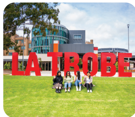
La Trobe University, Bendigo Campus