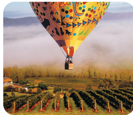
An early morning balloon ride