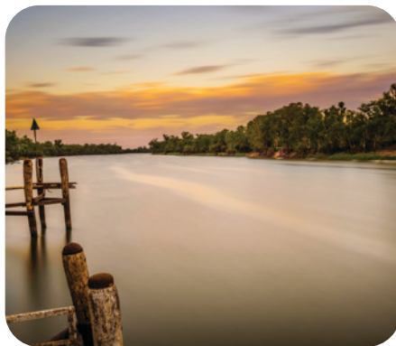
The Murray River near Mildura