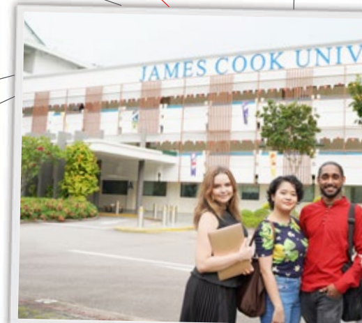
James Cook Unive