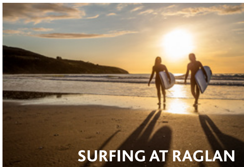
SURFING AT RAGLAN