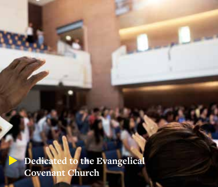
▶ Dedicated to the Evangelical Covenant Church