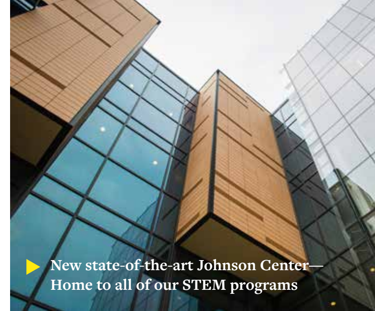
▶ New state-of-the-art Johnson Center—Home to all of our STEM programs