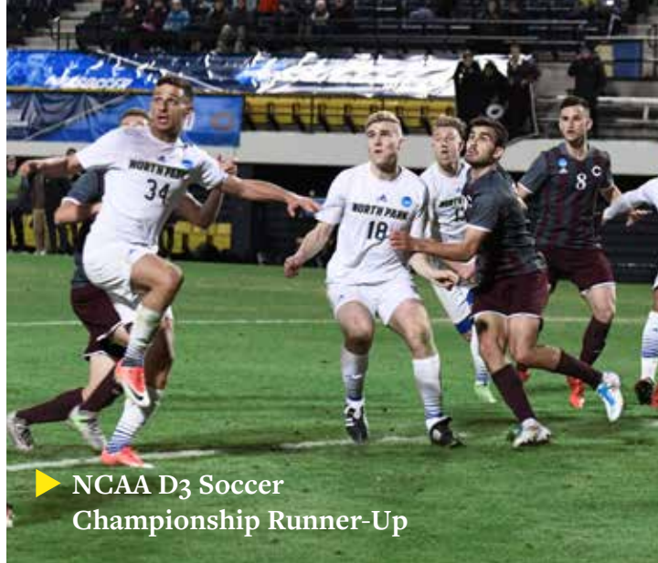
▶ NCAA D3 Soccer Championship Runner-Up