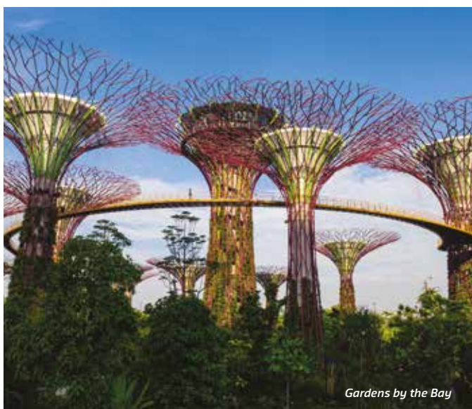
Gardens by the Bay

Your day-to-day living costs will vary based on your tastes, interests and financial position. You should plan a budget to suit your needs, but make sure it is flexible enough to allow for changes. Singapore is a large city with a range of options to suit the lifestyle you choose. We recommend you budget between SG$18,000 and SG$30,000 per year to cover essential living expenses.