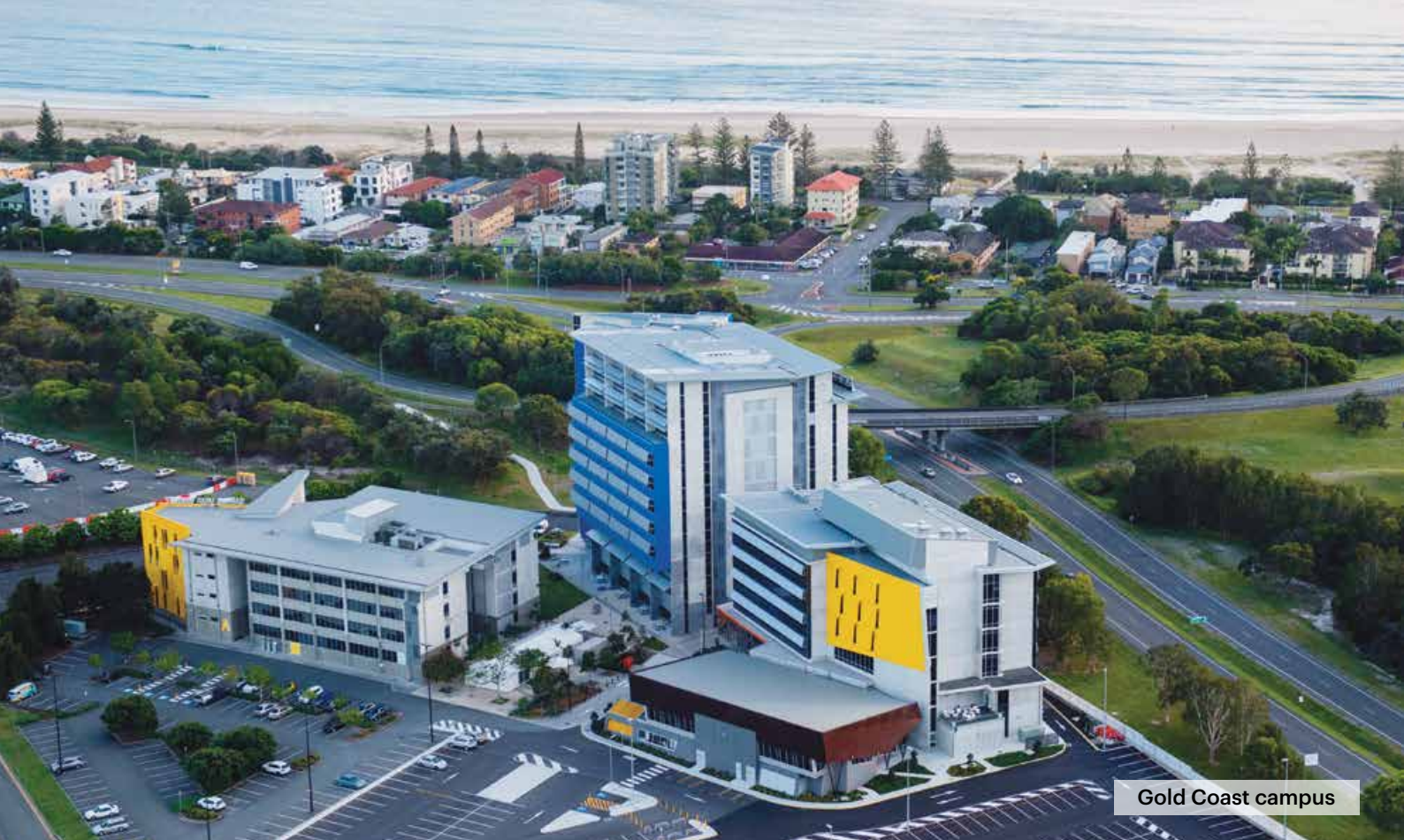
Gold Coast campus

The campus is spread across three contemporary buildings that house innovative learning spaces, health science laboratories, lecture theatres with live video broadcasting, computer labs and student lounges. More than 4,900 students study on campus at the Gold Coast.