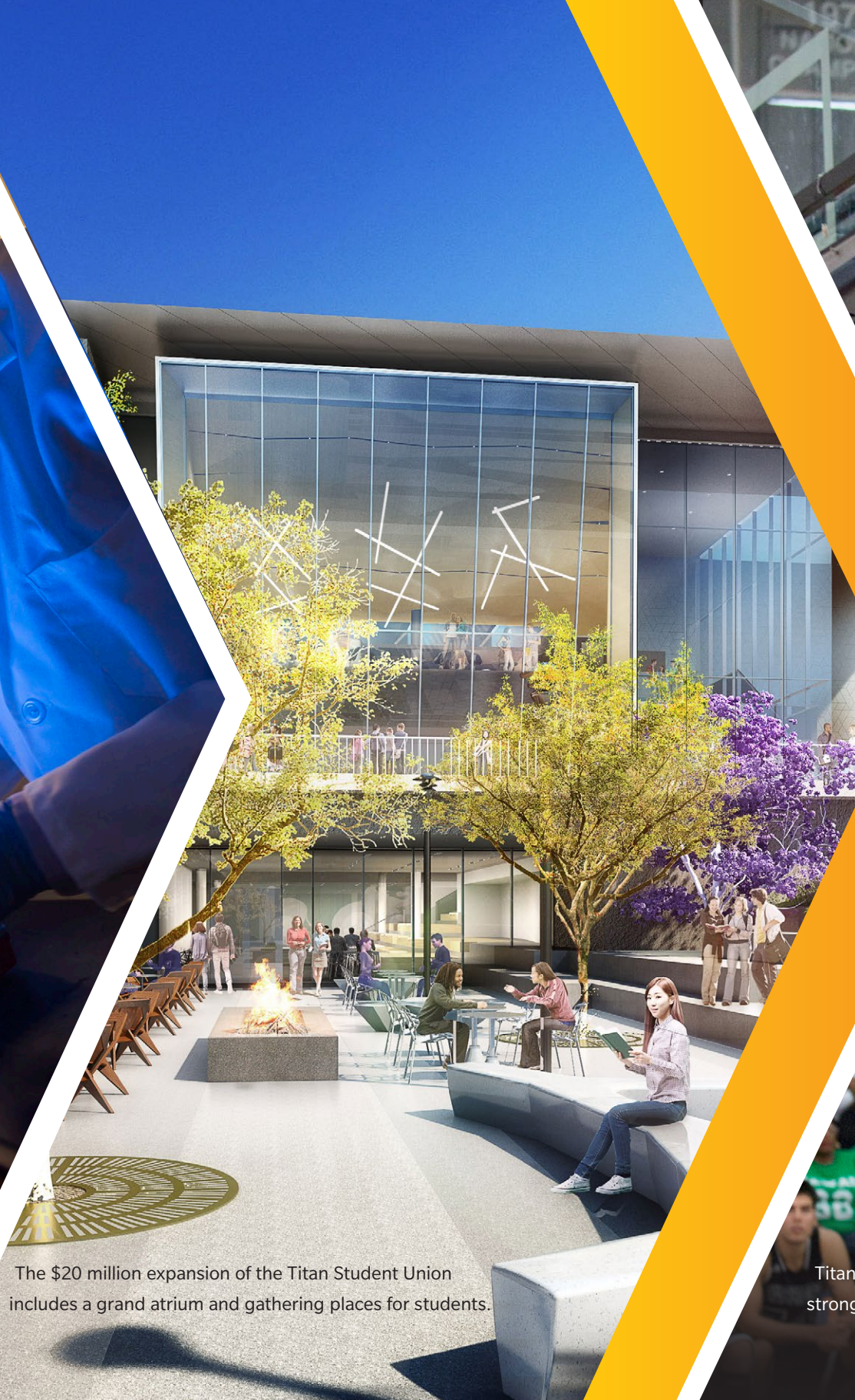
The $20 million expansion of the Titan Student Union includes a grand atrium and gathering places for students.