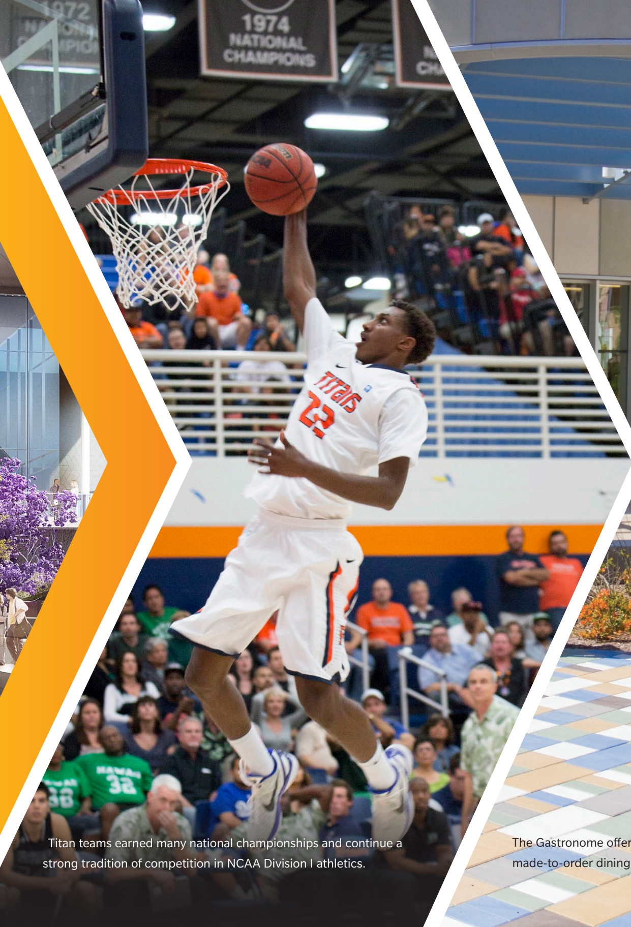
Titan teams earned many national championships and continue a strong tradition of competition in NCAA Division I athletics.