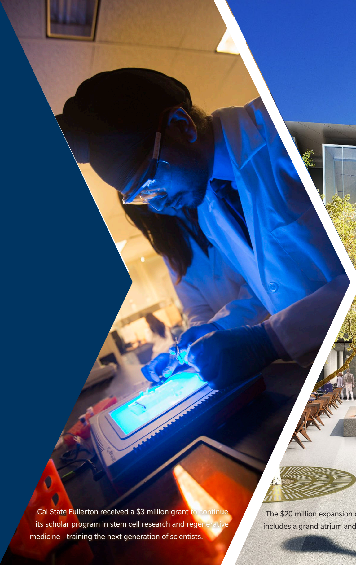
Cal State Fullerton received a $3 million grant to continue its scholar program in stem cell research and regenerative medicine - training the next generation of scientists.