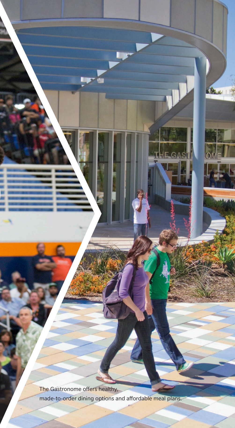
The Gastronome offers healthy, made-to-order dining options and affordable meal plans.