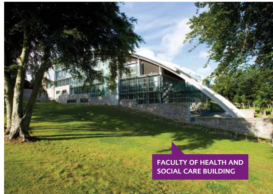
FACULTY OF HEALTH AND SOCIAL CARE BUILDING

We're proud of our teaching staff; proud of their quality and academic achievements as well as the practical experience they have in their area. Our professors, lecturers and tutors combine first-class qualifications with time spent in business or industry. They offer insight from both worlds – the theoretical and practical – to help inspire you.