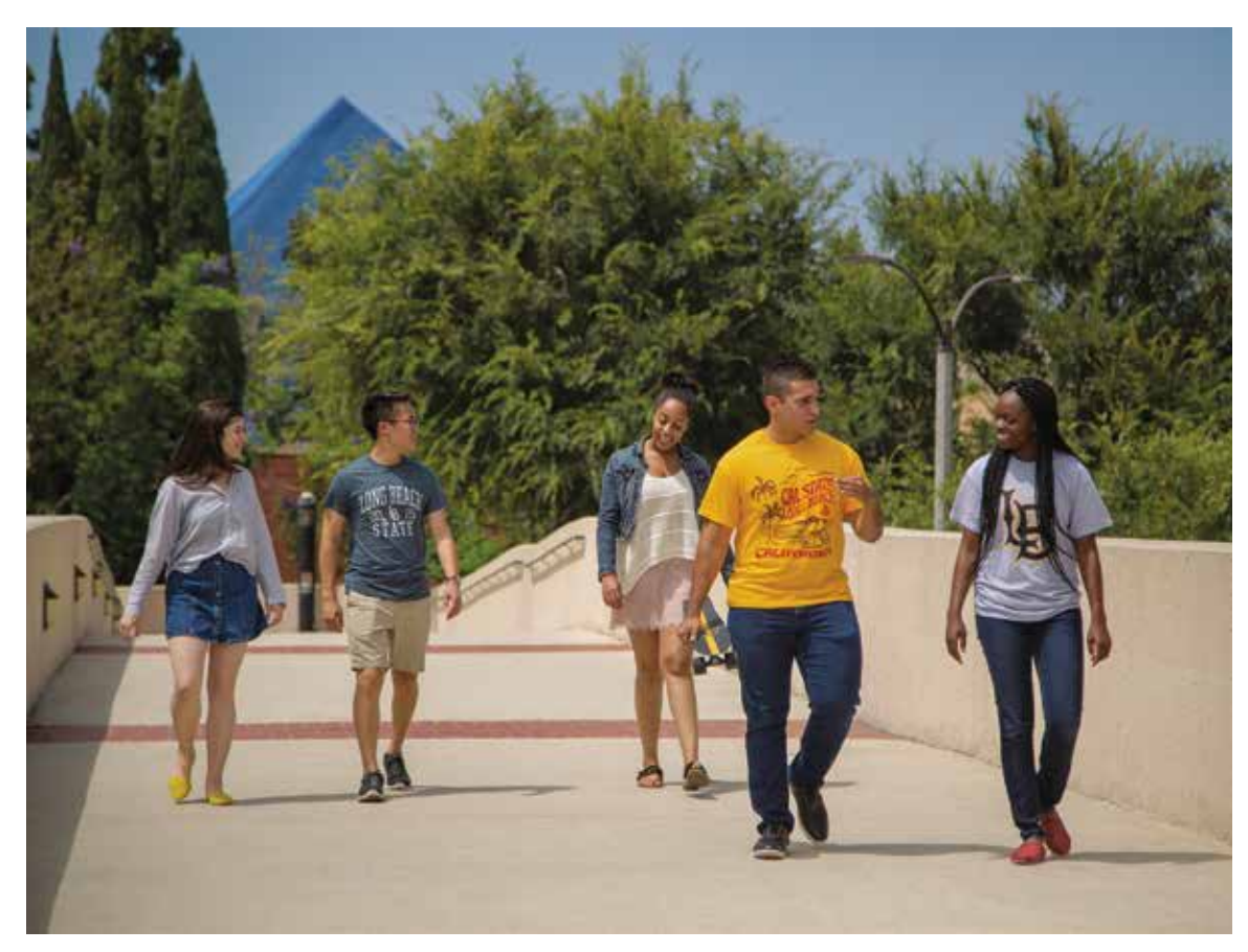
Students near the CSULB Pyramid