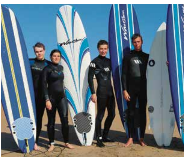
Students surfing at a local beach