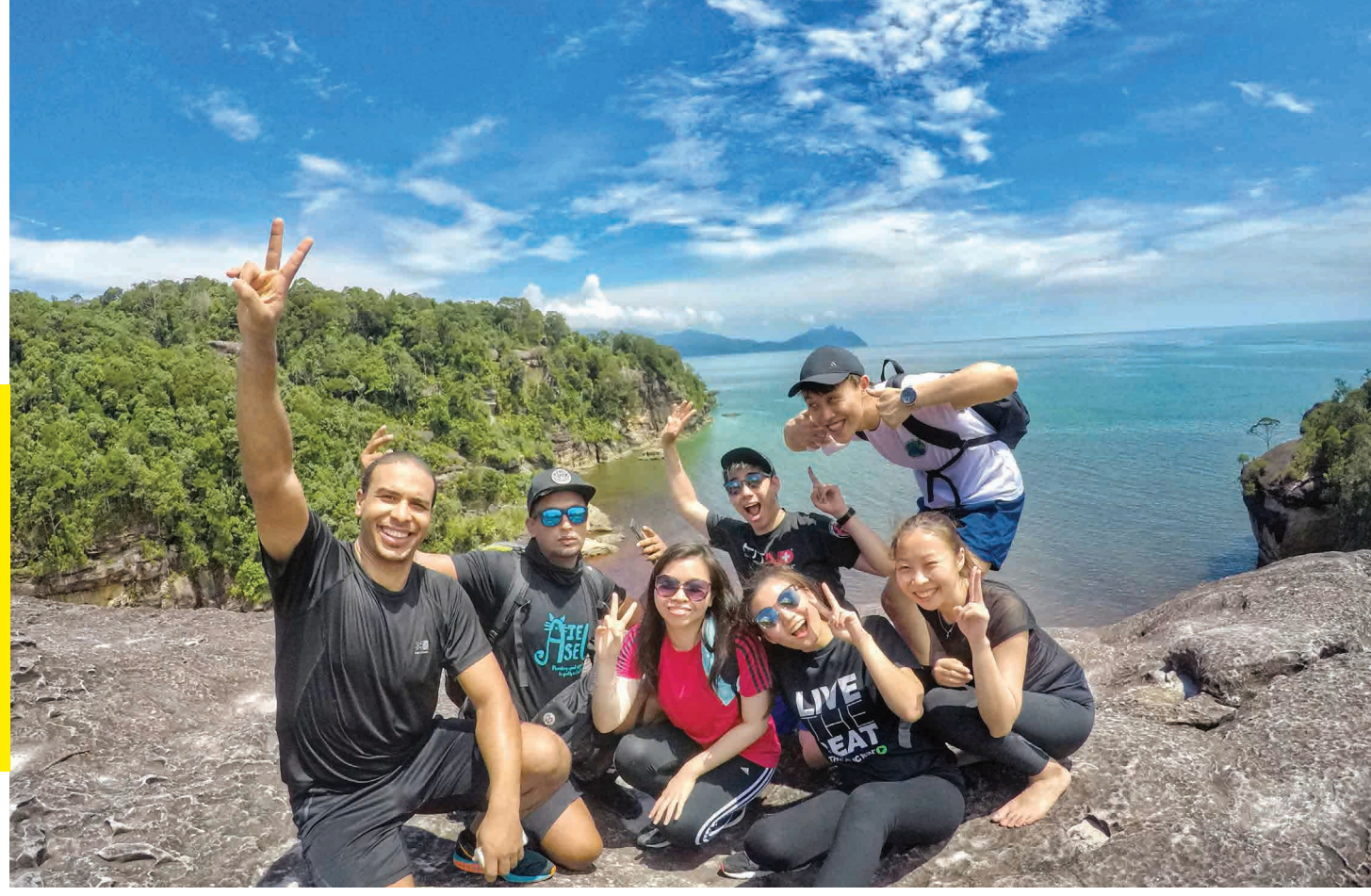
Explore the outskirts of Kuching within a day