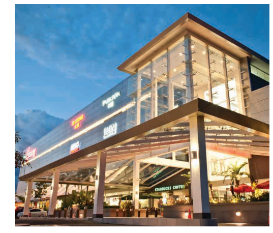
Shopping conveniences is just a short walk away

Go rock climbing at Fairy Cave, or if you're looking to experience some primary jungle without having to go into the interiors of Sarawak, join one of the many river kayaking trips offered by a local tour company. This is definitely an exhilarating way to enjoy the calm and peace of the rainforest.