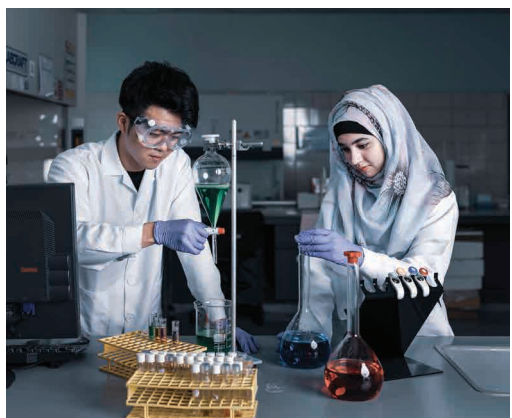
The campus boasts modern facilities for your studying and learning needs